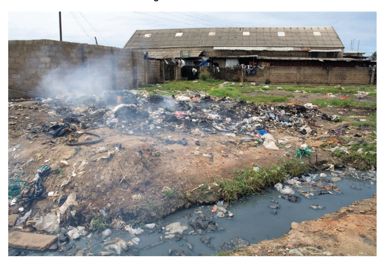
Fig. 4.1 for Question 4